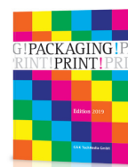
Special publications – related to special topics and companies