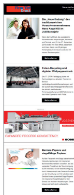
Weekly Newsletters Special Newsletters Stand-Alone Newsletters White Papers