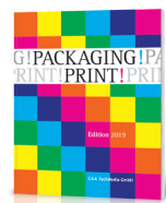
Special publications – related to special topics and companies