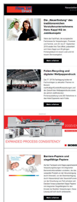
Weekly Newsletters Special Newsletters Stand-Alone Newsletters White Papers